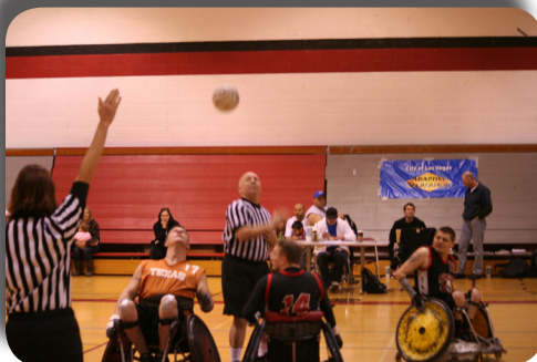
Opening Tip at Vegas Vengeance,

“Superheroes, Hooper. You crazy quads are now superheroes?”